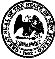
BILL RICHARDSON GOVERNOR