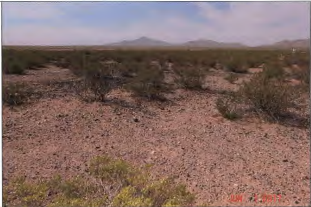
Photograph No. 5

No signs of erosion or depression on landfill cap. Vegetative layer was in good condition.