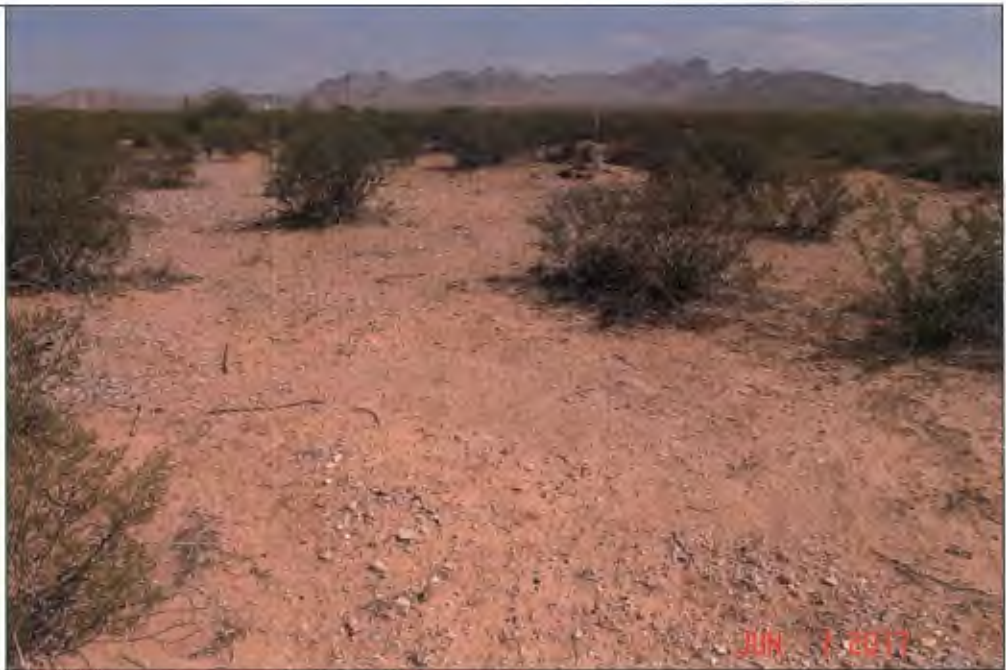
Photograph No. 3

No signs of erosion or depression on landfill cap. Vegetative layer was in good condition.