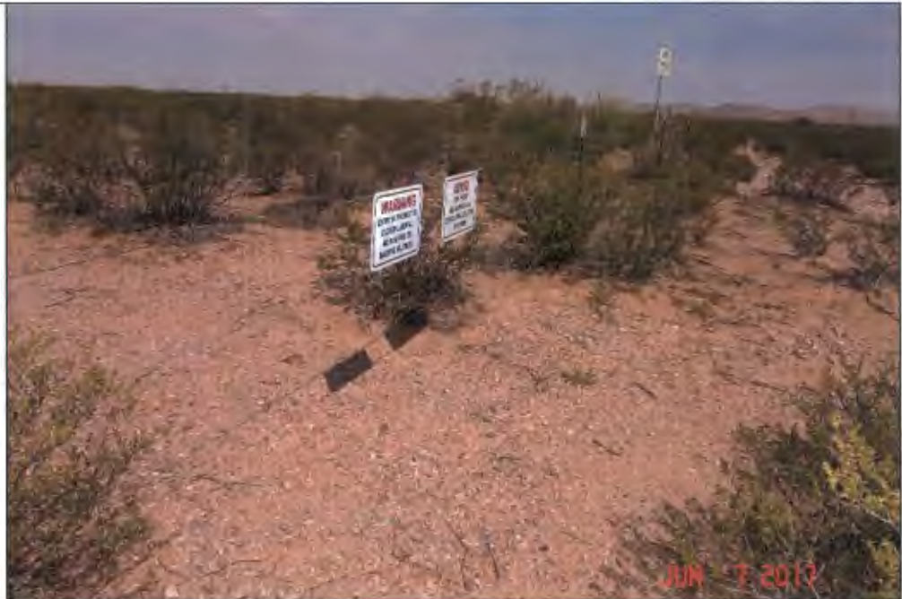
Photograph No. 7

Site perimeter fence and warning signs were in good condition.