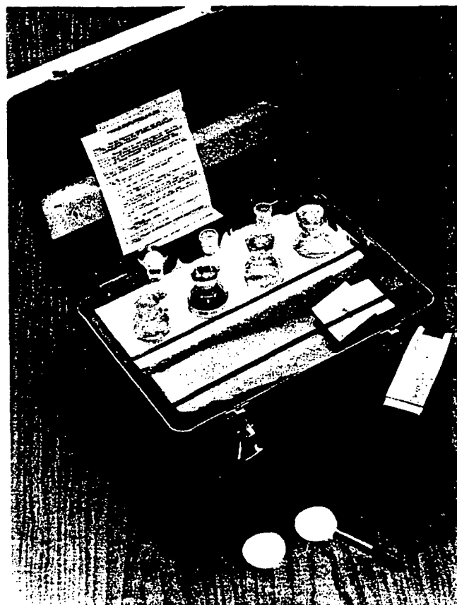
Fig. 1. Spot-test kit with reagents and filter papers. Shown also is a portable UV lamp. A test for TNT and a blank with Reagent A show blue-black color on the left circle and a clear blank on the right.

The inside of the case has been partitioned to hold the reagent bottles, the portable UV lamp (UVP Model G-14)* and charger, and the utensils and supplies needed for testing. The four reagent bottles are cushioned in a mold made of silicone rubber resistant to chemicals. Three test tubes are also cushioned to hold the dropper and stoppers to prevent contamination. Supplies include glass droppers, a spatula, filter papers, polyethylene bags, paper towels, a grease pencil, and instructions. The plastic bags are used to