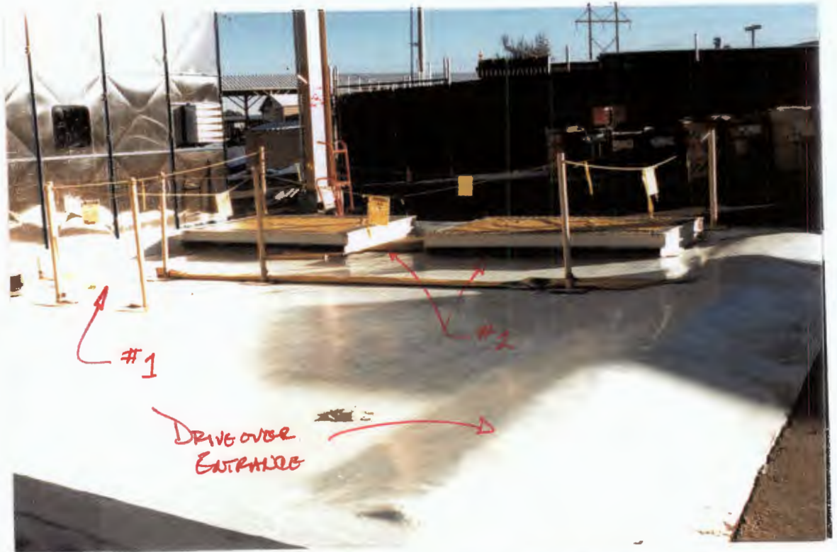
VIEW OF PAD #58 AT DRIVE OVER ENTRANCE NOTE: #1 TRENCH LOCATION #2 PITS