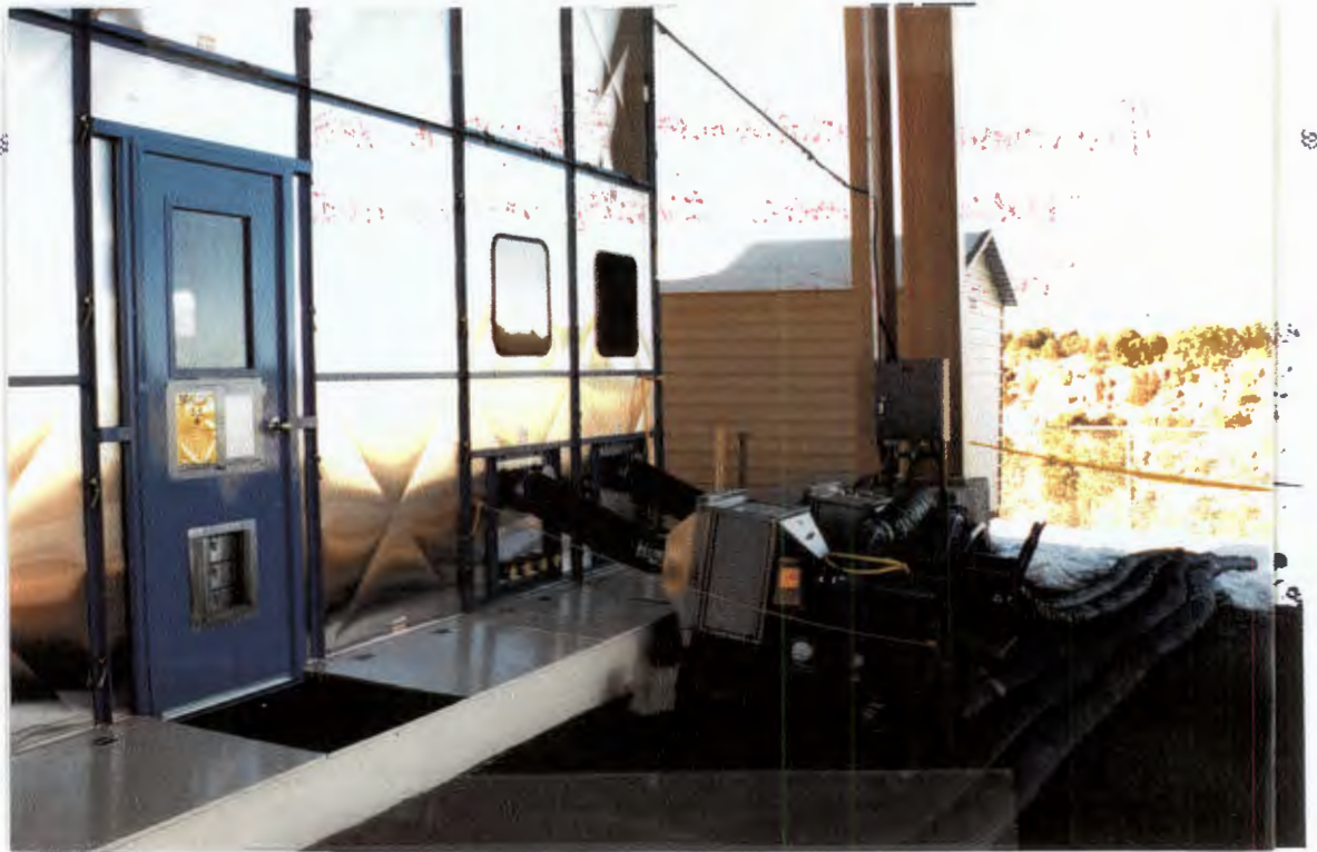
ENTRANCE TO MODULAR CONTAINMENT STRUCTURE ON TA-54, PAD #36.