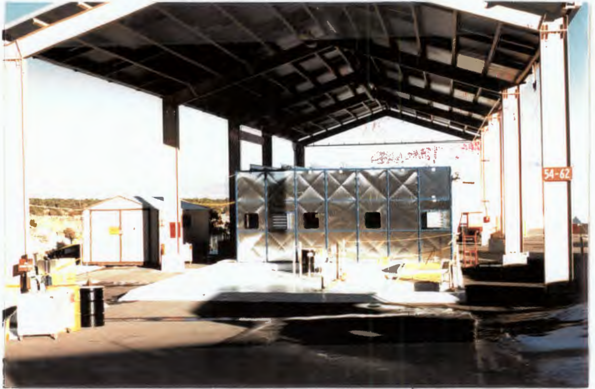
MODULAR CONTAINMENT STRUCTURE LOCATED ON PAD #36