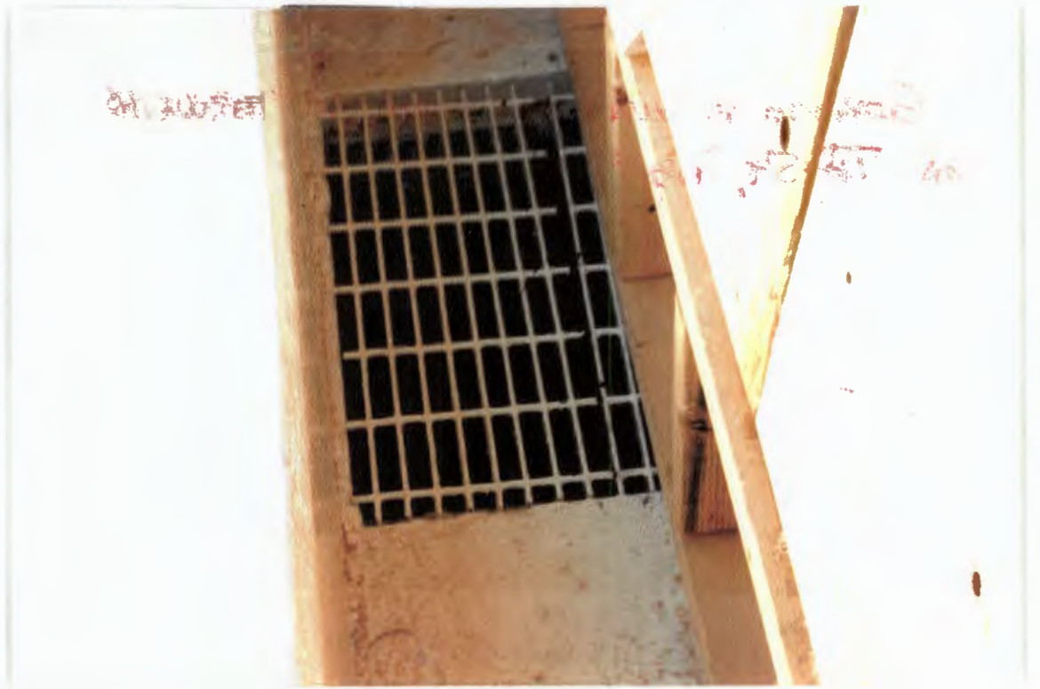
GRATE COVERING DRY SUMP