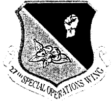
27 th Special Operations Wing