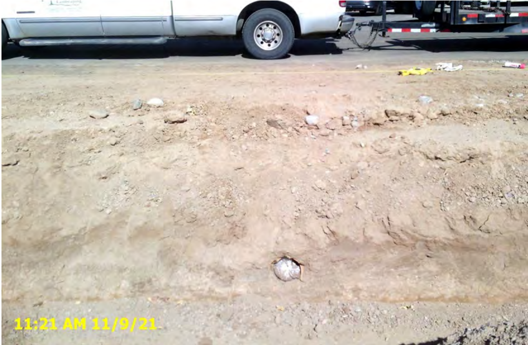
Figure 3-1 Placement of Broken Clay Pipe Pieces in Subsurface Clay Pipe at SWMU 226, Old Acid Waste Line