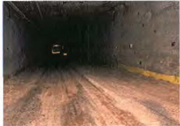
Brattice cloth placed on the floor of the repository and covered with run of mine salt

Although the pathway has been established, a significant number of activities, including installation and testing of interim and supplemental ventilation; completion of safety documentation and safety management program development; management assessments, and operational readiness reviews, will be necessary before waste emplacement can resume.