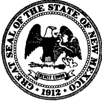
GARY E. JOHNSON GOVERNOR