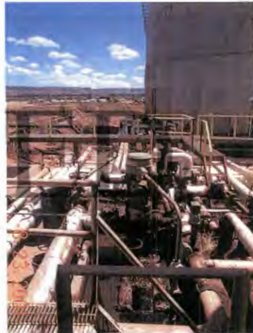
Pic #5- Fuel Oil Pump Basin