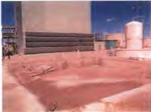
Pic #1- Old HCL tank area- location of old monitor well OW20 had high PH readings.