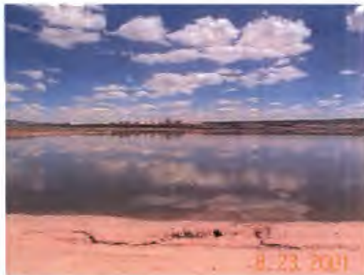
Pic #14- Pond #11