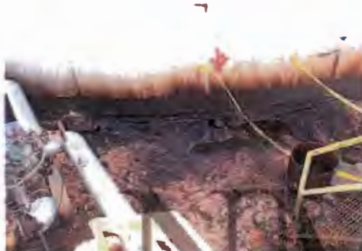
Pic #7- FCC tank 703