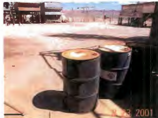
Pic # 3- Methanol drums in FCC area-need proper containment.