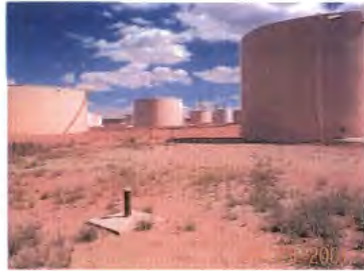
Pic #15- Tank farm area- foreground shows current recovery well #5 (RW-5).