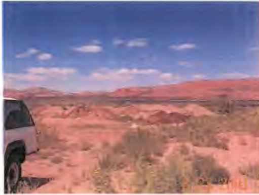
Pic #12 Contaminated spoils from fire training area and secondary oil skimmer (all non-hazardous).