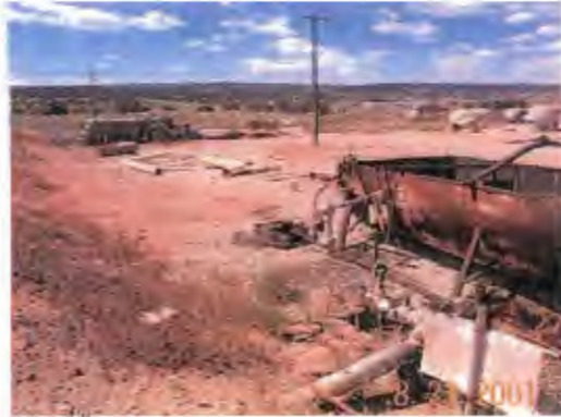
Pic #4- Below-Grade Tank (BGT) old fuel oil unloading catch tank with steam trap.