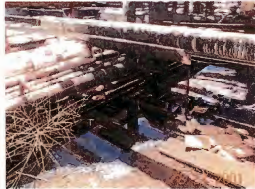
Pic #9- Area between tanks 345,344 and 337.