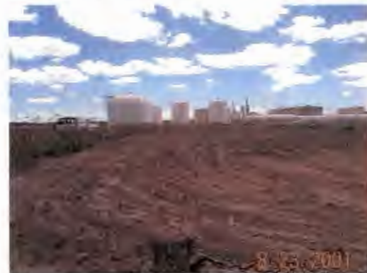
Pic #11- Railroad Rack Lagoon landfarm area.