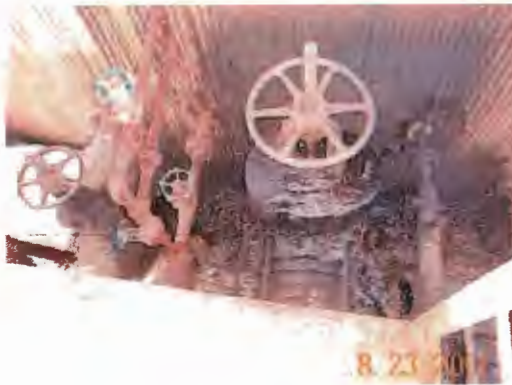
Pic #6- North side Fuel Oil Tank #706