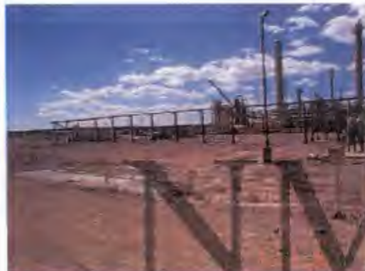
Pic #2- water discharge to ground. Area located NE of plant gas concentration unit. PH of water was measured at 7