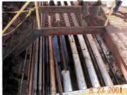
Pic #8- Pipe Rack between Tank # 703 & 706 area free oil on ground.