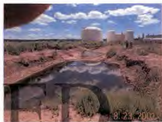
Pic # 10- Railroad Rack Lagoon area.